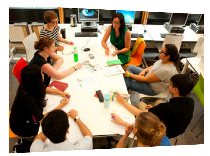
DISCOVER new ideas