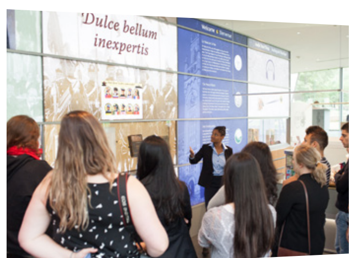
MAKE the world a better place