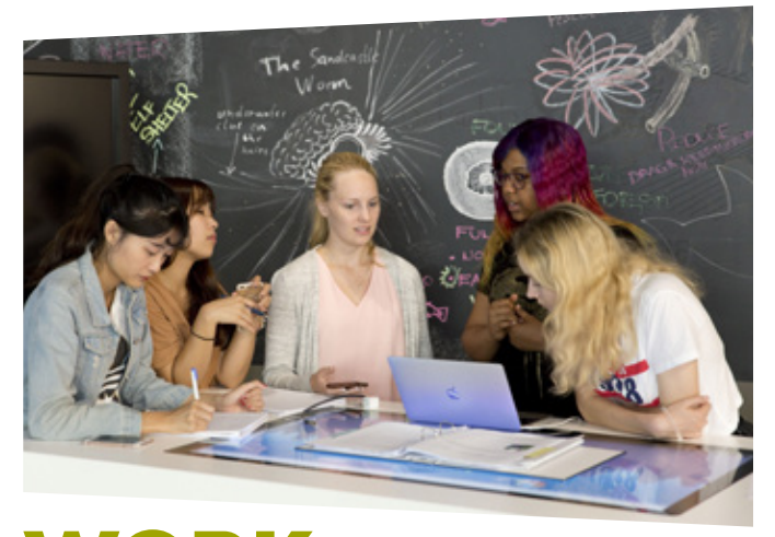
WORK together with students from all around the world